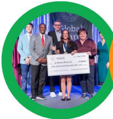
Sponsoring Teacher of the Year