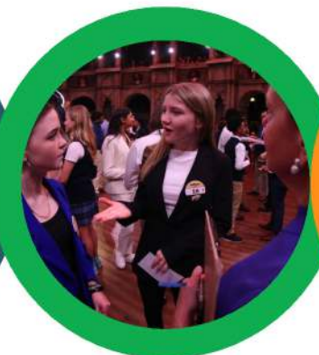
Providing opportunities for students to shine