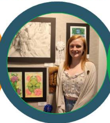
Supporting the arts