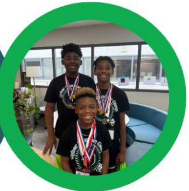
Expanding summer programs