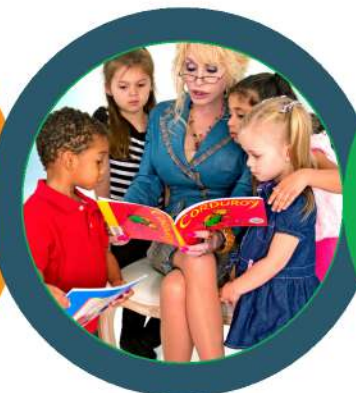
Promoting early literacy