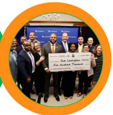
Building bridges to opportunity with partners